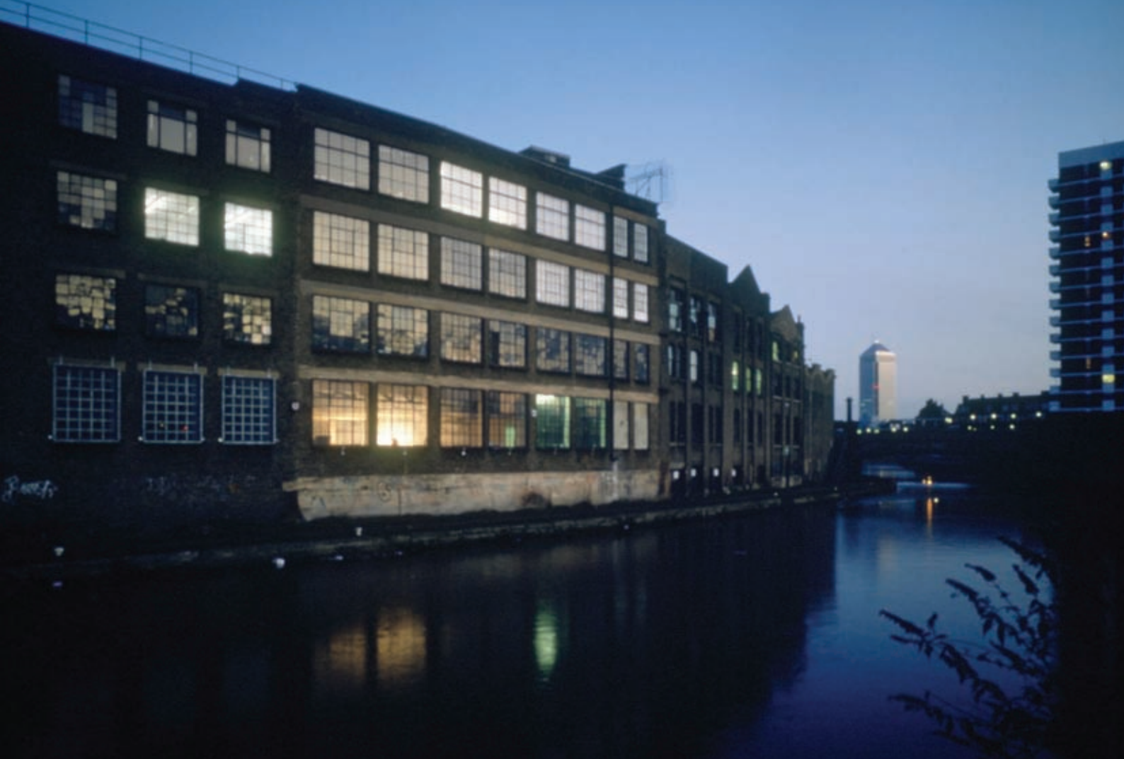
Image: Acme Studios' Copperfield Road building, London E3.