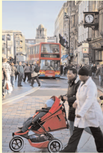
Blackett Street, Newcastle-upon-Tyne

Blackett Street, in the centre of Newcastle-upon-Tyne, was remodelled in 2001 to allow pedestrians and cyclists to move freely among the delivery traffic, taxis and high volume of buses that move through this lively urban space. There are no physical barriers or formal pedestrian crossings, yet injury accident rates have declined despite an increase in the volume of pedestrians. 35 An informal protocol with the bus companies retains bus speeds at around 10mph.