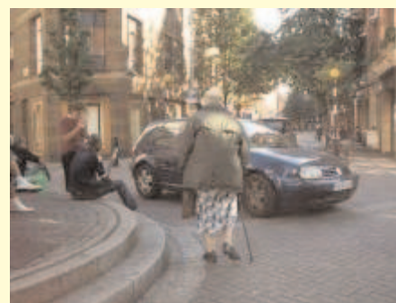
Seven Dials, Covent Garden, London