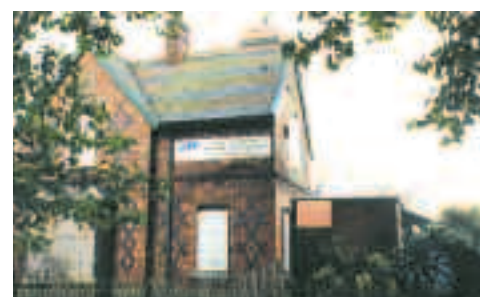
The voluntary sector took an innovative approach to generating community involvement